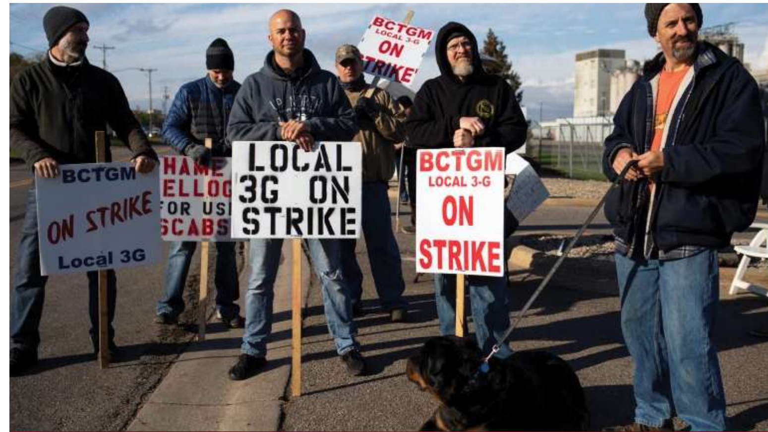
Workers at a Kellogg's plant in Battle Creek, Michigan. The Kellogg's strike was one of many notable strikes in October which inspired the term "Striketober."