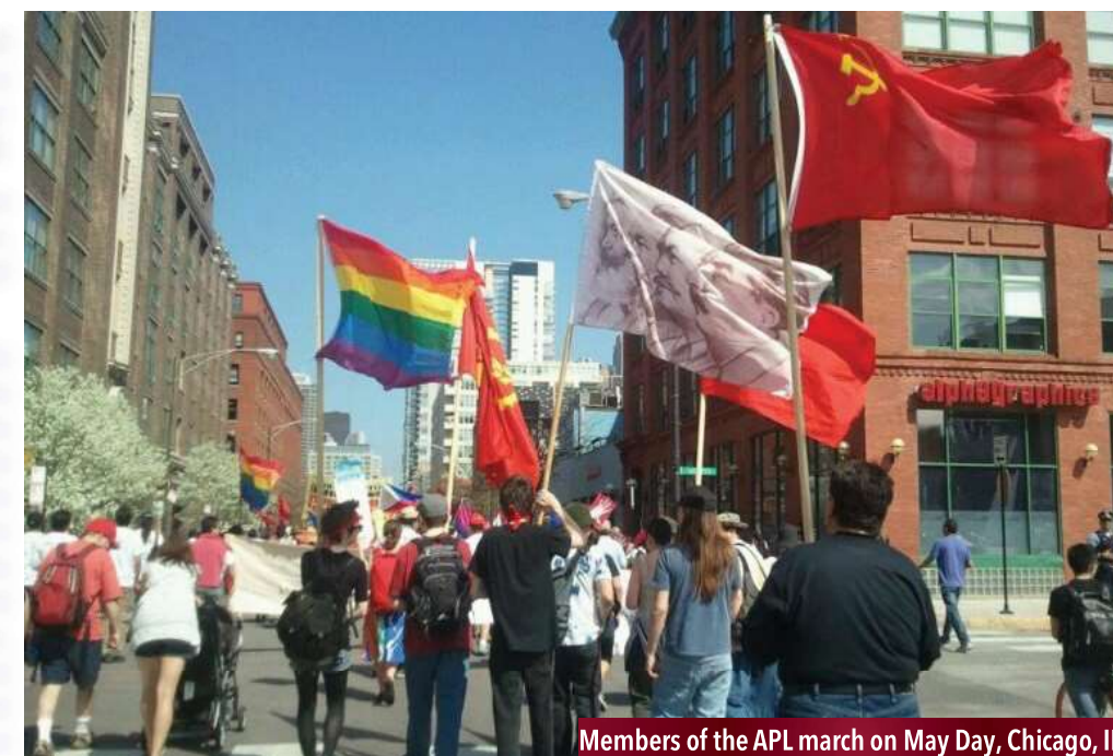
Members of the APL march on May Day, Chicago, IL

In prior stages of human development, with a more or less undeveloped understanding of science, these societies tended to assert moral idealism dependent on the establishment of social concepts such as gender identity and roles stemming from a rudimentary grasp on sex. Upholding these assertions reinforces the dominant class ideology of a given time. In slave society, the patriarchy emerged alongside private property rights and the enslavement of individuals as a means of social control, alongside the submission of women to control the inheritance of the established property