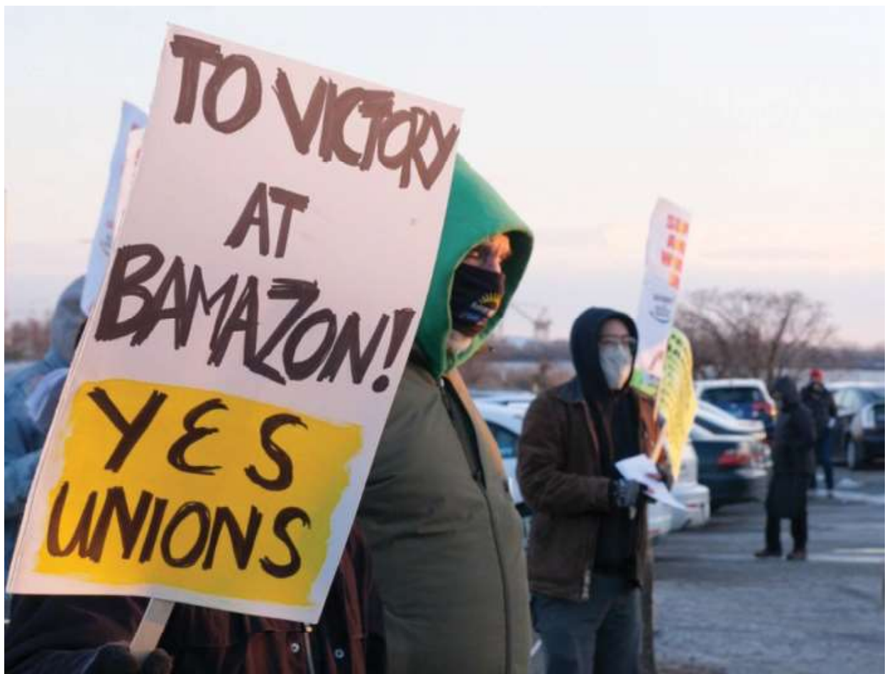
From the APL Labor Commission, Nov 30, 2021

On November 29th, the National Labor Relations Board (NLRB) ordered a new vote for the Amazon workers of Bessemer, Alabama after finding that Amazon employed illegal union-busting methods to successfully undermine the union drive. From 2016 to 2017, 41.5% of union drives collapsed under illegal anti-union measures from their employer company. Despite being one of the largest and most high-profile companies to have been exposed in union-busting, Amazon continues to claim that all workers are free to join a union.