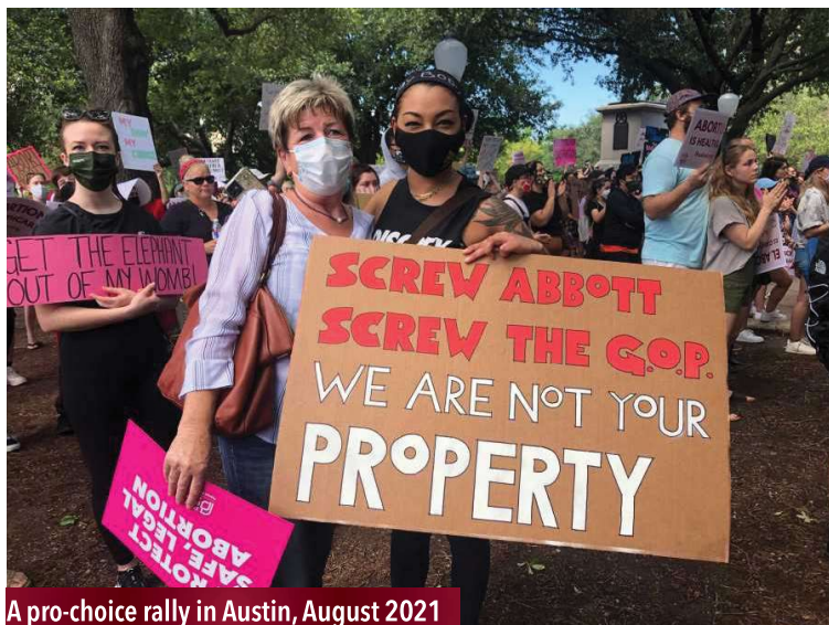
A pro-choice rally in Austin, August 2021

By: Ian Cox, Red Phoenix Correspondent Texas Sep 6, 2021