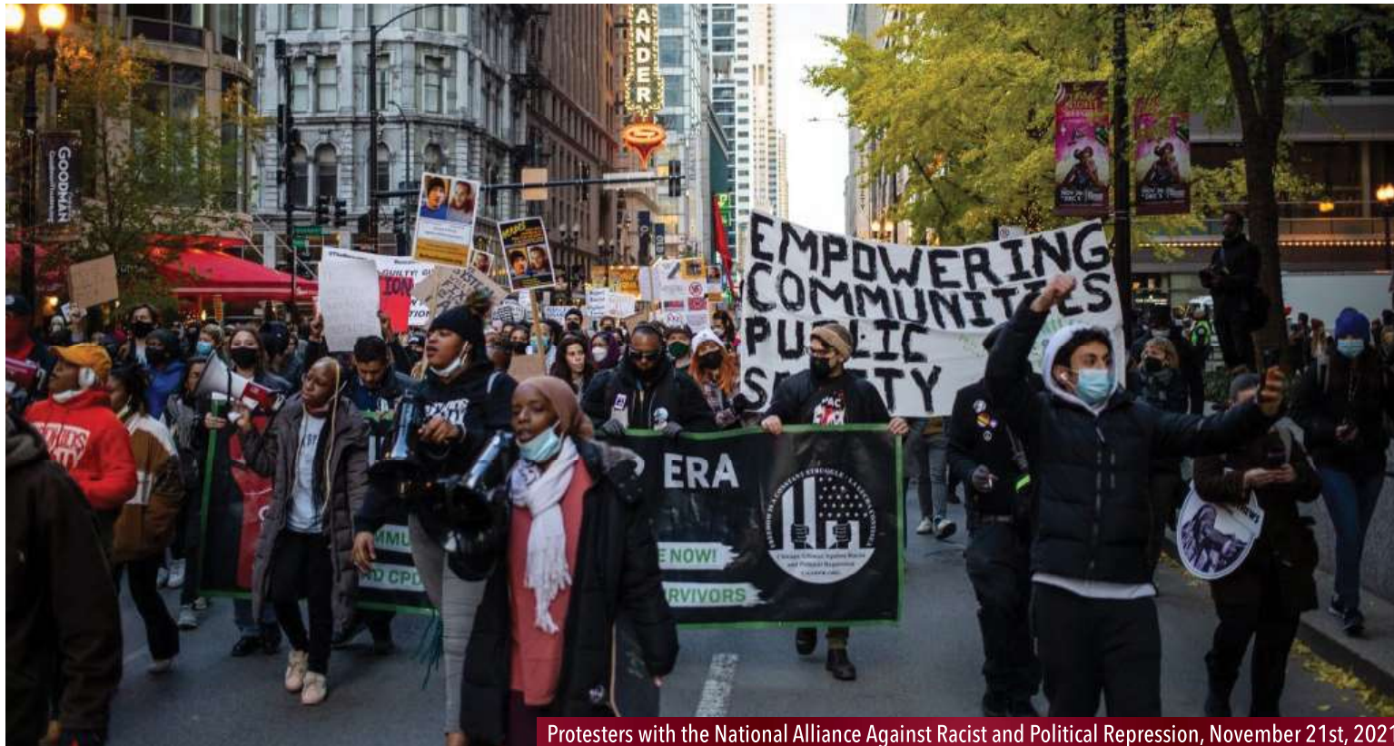
Protesters with the National Alliance Against Racist and Political Repression, November 21st, 2021