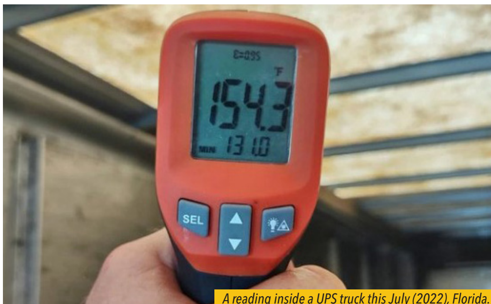
A reading inside a UPS truck this July (2022), Florida.

The delivery drivers and warehouse workers are aware of this very danger, as over the course of these past Summer months, UPS employees all across the country were succumbing to extreme cases of heat exhaustion and at times fatal instances of heat stroke. Delivery drivers across the nation were reporting temperatures as high as 116 to 120 degrees in their trucks. Drivers typically have anywhere from 150 to 200 stops a day, with as many as 300 packages to deliver during shifts that last up to 14 hours. Yet, the trucks they drive lack air conditioning due to the company's claim that it would be "ineffective," but one could easily argue that allowing the trucks to reach temperature