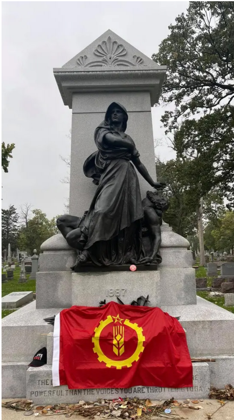
The American Party of Labor flag at the Haymarket Martyrs Monument, 2021, Forest Park, IL.

Resurgent unionism has nonetheless risen in these conditions. Countless strikes organized at the workplace from fast food fights for 15, to graduate student unions, to rideshare strikes emerged in 2019, which led to the huge growth in union efforts at some of the largest companies in the US, including Starbucks and Amazon. These movements have come to define the growing leftist movement in the United States, despite corporate attacks and sabotage. The DSA Convention, largely panned for its procedural "difficulties" and reformist perspectives, nonetheless clearly declared democratic unionism to be the beating heart of the American left. This growing movement demands greater organization than what currently exists, and workers have risen, often autonomously, and against the reformist democratic party and moderate union leadership, to that challenge. Bringing the militancy of our May Day marches to this day in this context, reflects the general turn in American left strategy to bring our politics to the American worker, to merge our spaces, and make left spaces less exclusive and distinct from the lives of American workers.